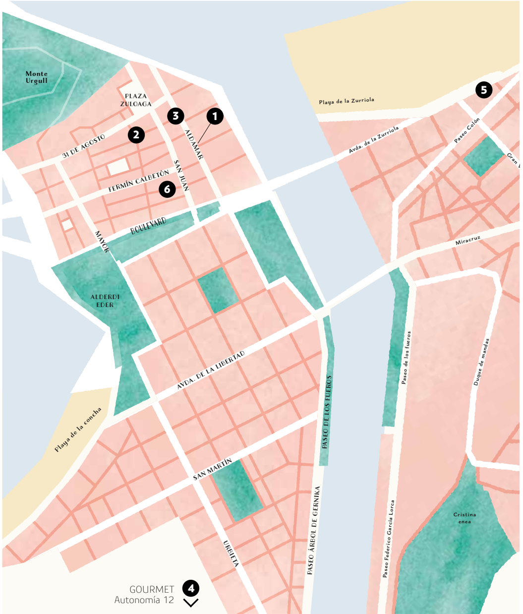
1. AITOR LASA GAZTATEGIA, Aldamar 12. - 2. CHOCOLATERIA ARAMENDIA, Narrika 22. - 3. GOÑI ARDOTEKA, Aldamar 3. - 4. GOURMET, Autonomía 12. - 5. KAÑABIKAÑA, Zurriola hiribidea 36. - 6. LA SEVILLANA, San Lorenzo 6.