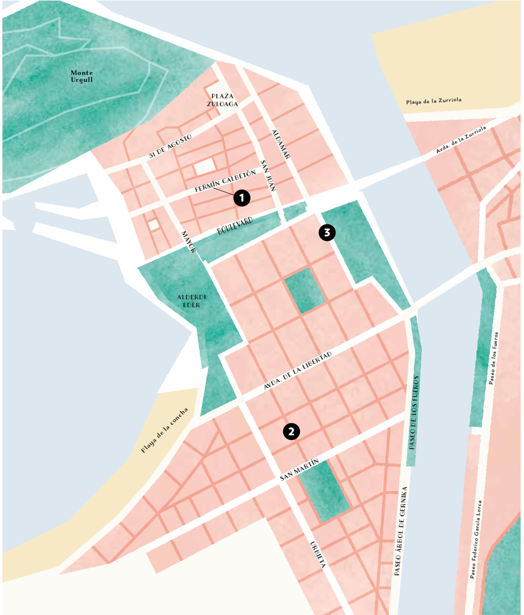
1. ELKAR, Fermin Calbetón 21. - 2. FNAC, CC San Martín - Urbieta 9. - 3. HONTZA, Okendo 4.